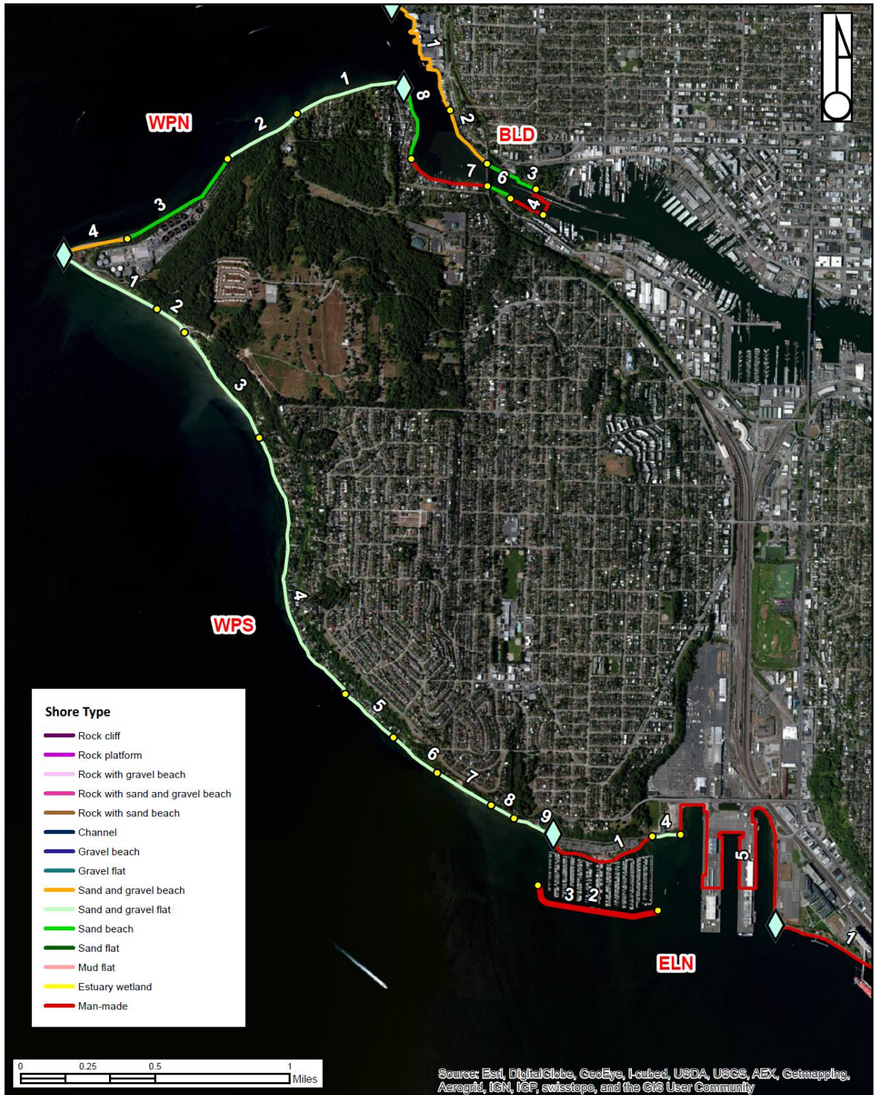
Figure 9422-3 Map of shore types and segment identification based on geographic areas (segment group)