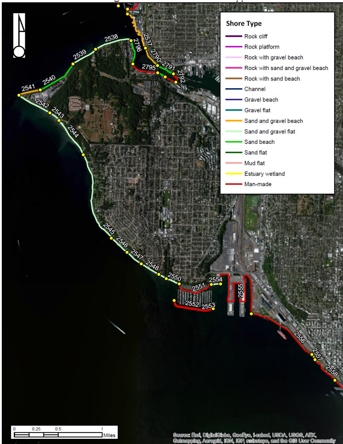
Figure 9422-1 Raw segmentation map derived from Shorezone based on the 15 shore types in the data base